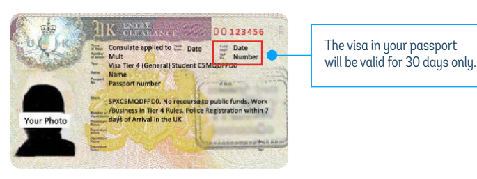
Temporary Tier 4 (General) Student visa

The Home Office has introduced the Biometric Residence Permit (BRP) card for applicants applying for a visa to come to the UK for more than six months. You will apply for a BRP at the same time as you apply for the Tier 4 (General) student visa. If your application is successful, you will receive a temporary travel visa sticker in your passport valid for 30 days (which starts either 30 days before the course start date on your CAS or 7 days before your intended date of travel to the UK, whichever is later). This will allow you to enter the UK. You must then collect your BRP from the post office branch you selected as part of your application no later than 10 days after your arrival in the UK.