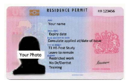
Biometric Residence Permits (BRP) Card

https://www.gov.uk/biometric-residence-permits